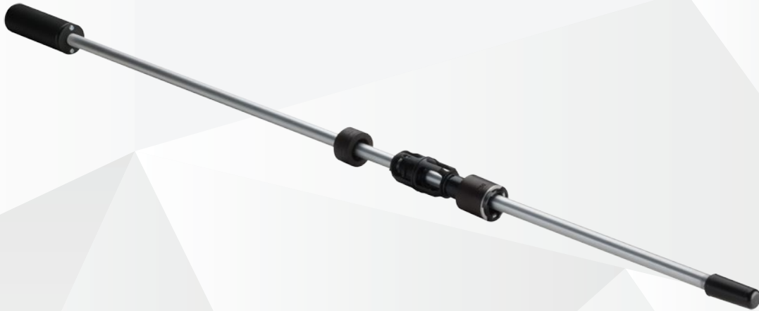
Density Mag Plus Probe with HGP Canister

Inventory management and reconciliation, certified tank testing or leak sensor monitoring, without the disruption caused by breaking up the site to install cable ducting.