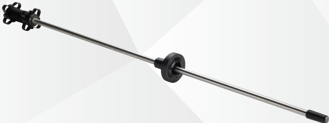
Stainless Steel Mag Plus Probe