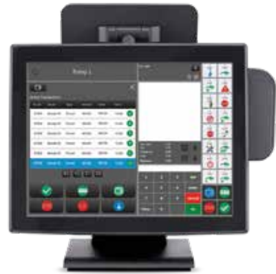
POS - Refueling