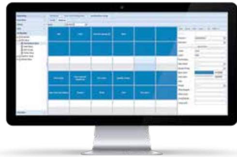
Centralized POS configuration by the HOS

The cloud BOS can be connected to from anywhere & at anytime via simple login. It allows remote management of a specific store's needs (e.g. local accounts, local products, DODO merchants price control).