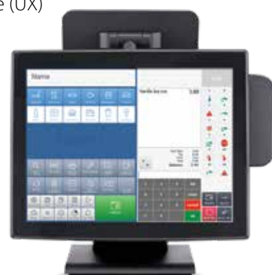
POS – Sales Mode