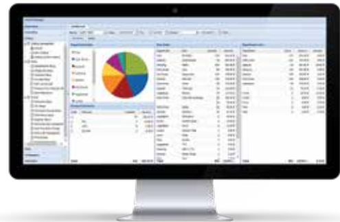
HOS – Sales Dashboard